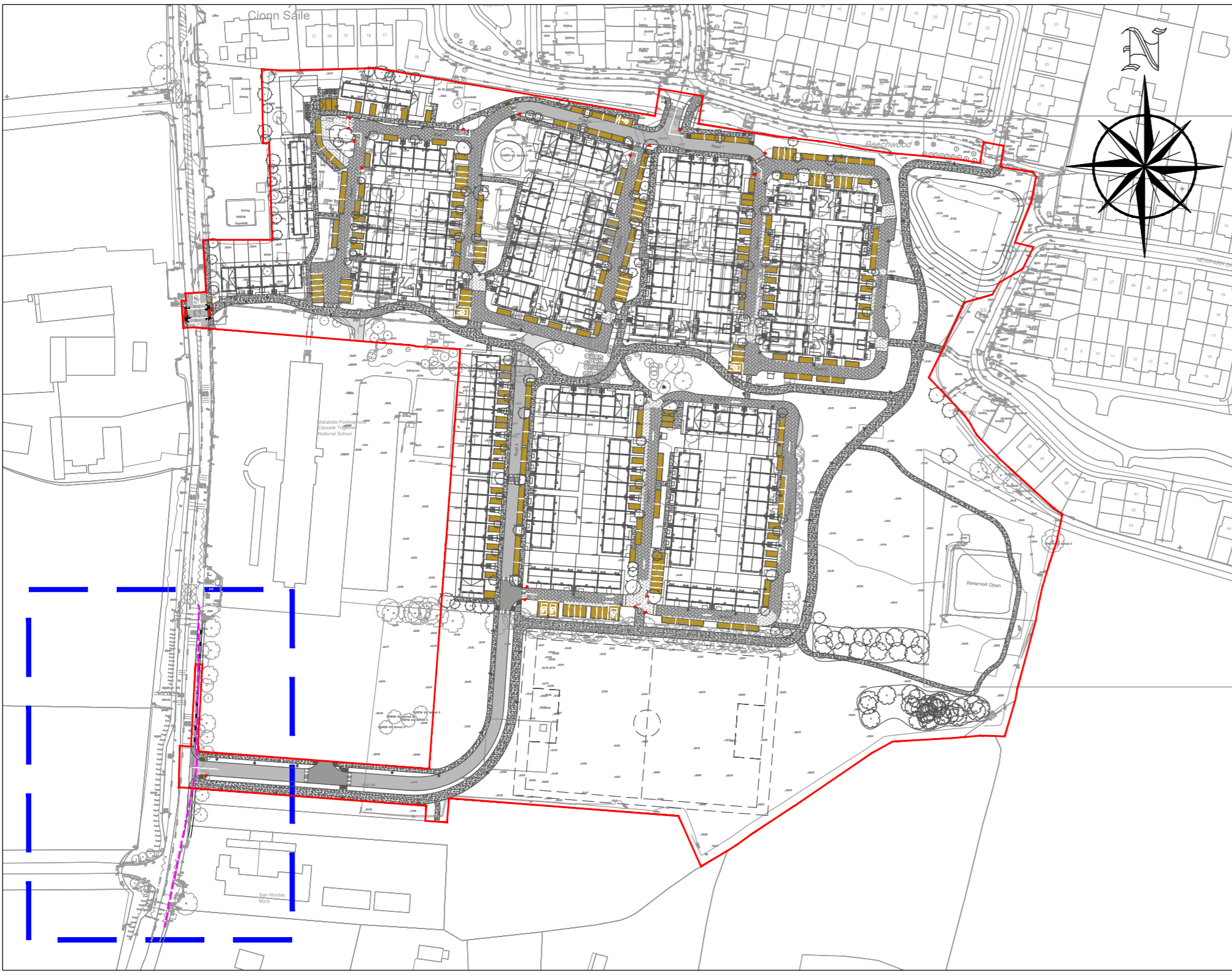
KEY PLAN. SCALE 1:2000